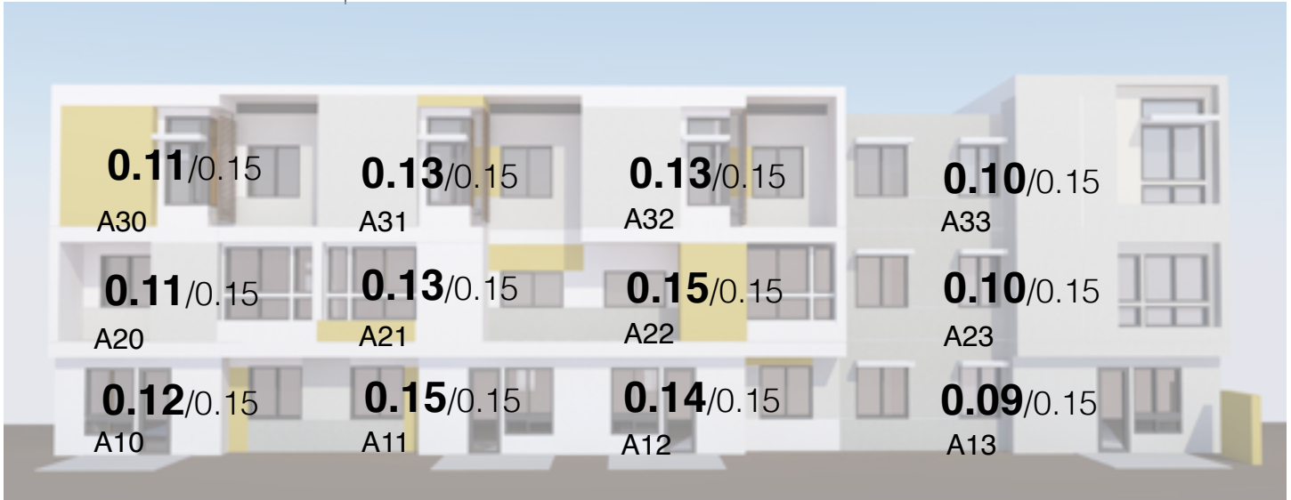
Table 3: Actual NACH result versus target NACH for units in Flat A.

0.12 /0.15 ← Target NACH A10 ← Actual NACH result ← Unit number