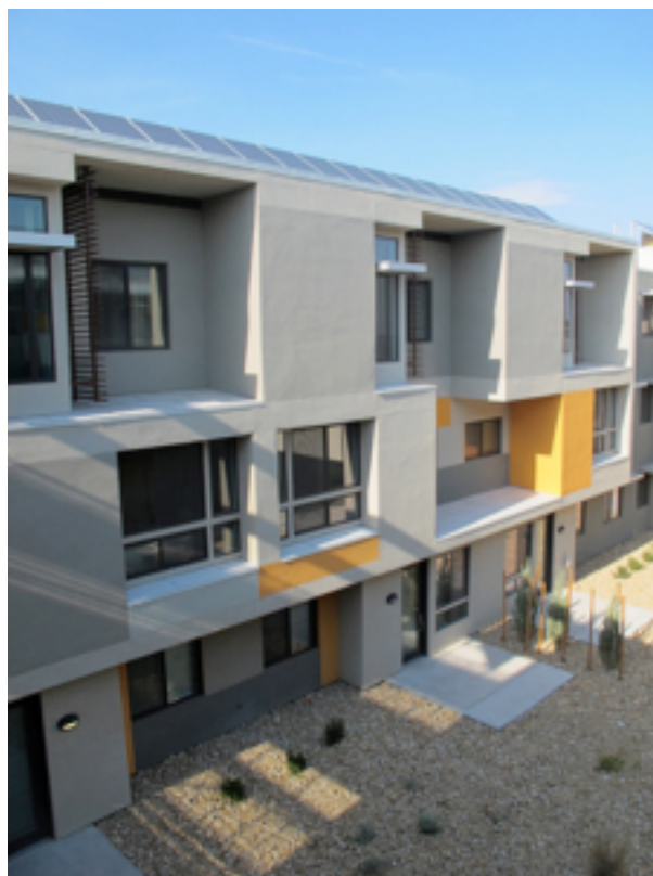
View of the south elevation of Flat A with solar array visible on the roof.

The wind turbines project a powerful visual image of the project’s commitment to sustainable energy systems. During winter and spring months, when winds off the Chihuahuan Desert to the west blow strongest, the turbines contribute most significantly to energy produced on site.